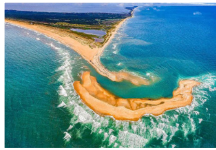
Shelly Island appeared and grew off Cape Point at Hatteras Island, April 2017.

shoreline of Cape Point. Because this area is the spot where the Gulfstream and Labrador currents meet, Cape Point is no stranger to sudden changes in