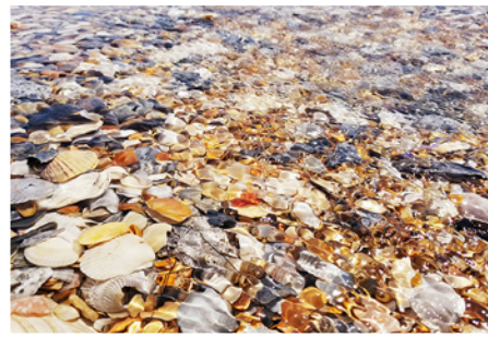
Shelly Island got its name for the abundance of shells visitors can find.

the hidden shoals that lie beneath the shallow waters. The waters off the Cape Hatteras National Seashore are littered with the wreckage of thousands of sunken ships that ran aground on the treacherous shoals over the past several centuries—hence the name: "Graveyard of the Atlantic."